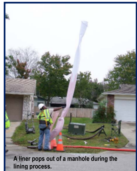
A liner pops out of a manhole during the lining process.